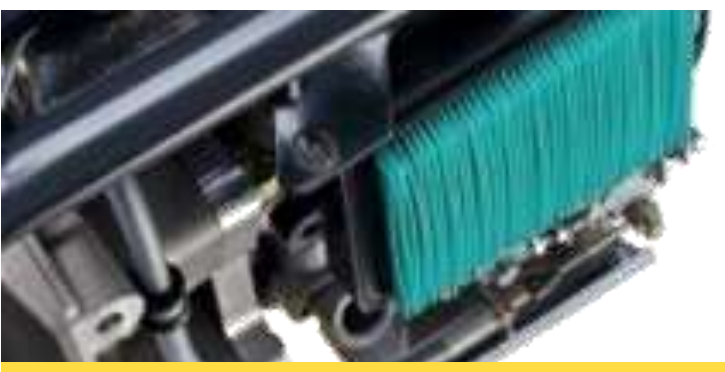
2. Paper air filter